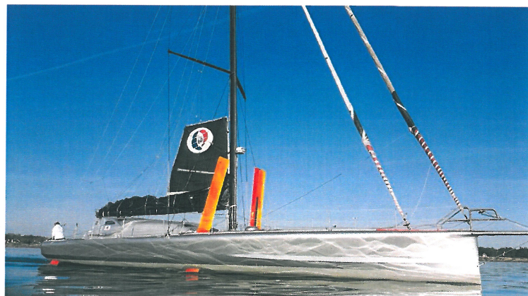
Ship: SPIRIT OF YUKOH