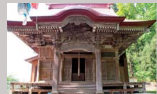
Fumoto no Jizo sama (Walking Map of Mt. Rokumanki)

Year of founding unknown. It is called "Nakadori Jizo sama" and enshrined here is the Buddha, the Goddess of Long Lasting Life. It was located in front of Zenshoan Temple until early in the Showa era.