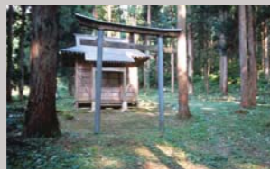
Fudo Shirine (Nagamori Map 3-C)

Address: 24, Nagamori, Minami-Unonuma City Phone: 025-775-2419 Opening Hours: Lunch 11:30-15:00, Dinner 17:00-21:30 (By Reservation Only) Meal Charge: ¥5,250~ Room Rate (With Half Board) per person: ¥12,600~