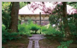
Shinjoji Temple (Walking Map of Mt. Rokumanki)

Founded in 1654, Zenshoan is a branch of the Soto Zen Ryukokuji Temple. This area in Nagamori seems to have been a battlefield as many weapons used during past wars are excavated here.