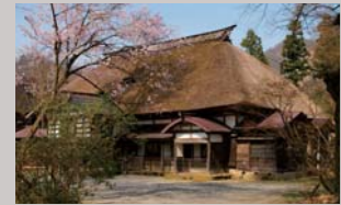
Keyaki-en (Nagamori Map 2-D)

Built between 810 and 823, this extremely old temple is dedicated to safe childbirth and the health of children. Many visitors come from all over the country to pray here.