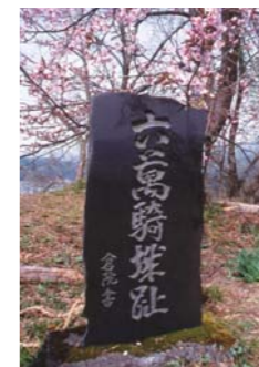
Monument of Rokumanki Castle Ruins