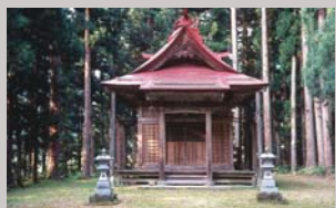
Isurugi Shirine (Nagamori Map 3-D)

Year of founding unknown. According to old writings in Suzaka City, Nagano Pref. warriors prayed in this shrine after a battle in the Nagamori area in June 1510. This area is known as Funayama (boat shaped mountain) after its geographic shape.