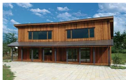
Satoya (Nagamori Map 2-B)

Research and development focused on "rice, koji and fermentation" gained through experiences in sake brewing is carried out here. *Employees only. No visitors please.