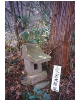
Route to Mt. Rokumanki

Yasaburobasa's grandchild was left behind after the death of his parents and Yasaburobasa was looking after the grandchild. One stormy day she was too hungry and she bit the grandchild's cheek. Immediately she turned into a devil and started kidnapping children in the snow storm. But after a while she regretted her evil deeds and visited her temple to be forgiven and purified. She flew away after the monk's purification. Ever since then, she comes back to the temple on the 8th of December to give donations to the temple. Even today, the local residents describes a stormy day as "the 8th day storm".