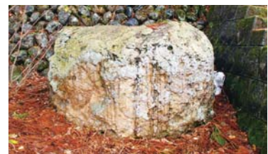
"Grandma Yasaburobasa's chair" from folklore.

Japanese folklore has tales of Grandma Yasaburobasa in many parts of Japan. In the local Fumoto District lays a stone that was believed to be Grandma Yasaburobasa's resting stone.