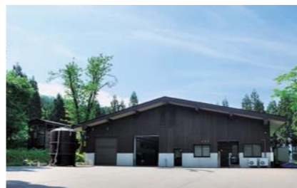
Fukasawahara Shochu-kura (Nagamori Map 3-C)

Club House for farm renters (Authorized Persons Only) Opening Hours: 10:00-17:00, Holiday: Tuesday