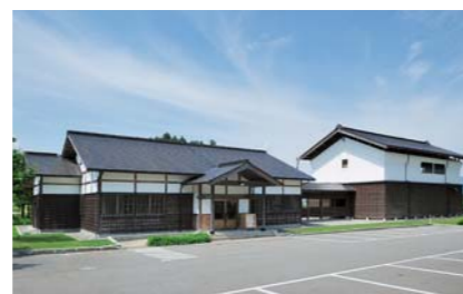
Hachikura/Hachikura Library (Nagamori Map 2-C)

This shop is introducing traditional Japanese gift-wrapping styles and the meaning behind each style. A mini theater shows a film about Unonuma no Sato and the Hakkaisan sake making process.