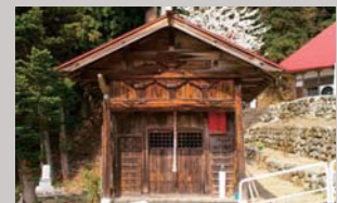
Koyasu Jizo (Nagamori Map 4-C)

Year of founding unknown. According to old writings in Suzaka City, Nagano Pref. warriors prayed in this shrine after a battle in the Nagamori area in June 1510. This area is known as Funayama (boat shaped mountain) after its geographic shape.