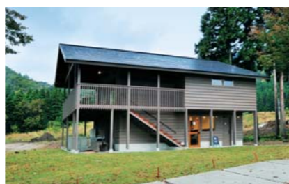
Farm Club House (Nagamori Map 1-D)

This shop located on the 1st floor of the Yukimuro has a variety of fermented foods as well as snow chilled vegetables, meats and sweets. Also, a private shochu storage service is offered.