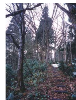
Route to Mt. Rokumanki