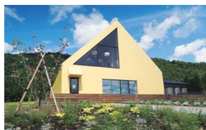
Blanc de Blancs (Nagamori Map 2-C)

Please contact Hakkaisan Customer Service: 0800-800-3865 between 9:00 to 17:00 weekdays.