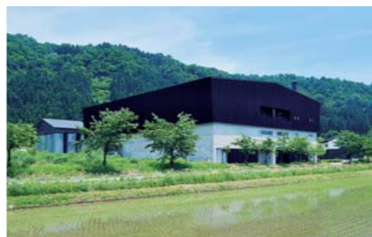
Hakkaisan's 2nd Brewery Daini Kowa kura (Nagamori Map 2-C)

Beer Brewery will be moved to Unonuma no Sato. The brewery and the retail store will be open in 2018 summer.