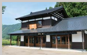
Sennen Kojiya Main Store (Nagamori Map 4-D)

Founded in 1543, Shinjoji Temple is a branch temple of Soto Zen Chofukuji Temple. The current structure was built in 1788.