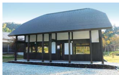
BukaBunka Seasonal Local Cuisine (Nagamori Map 2-B)

Sake kasu lees, a byproduct of sake making, is used in this shochu factory. Fresh lees are distilled to make kasutori shochu. Fermented rice is distilled to make kome shochu. *Employees only. No visitors please.