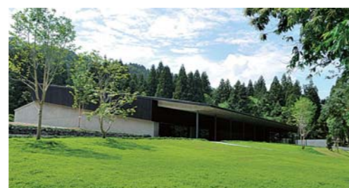
Hakkaisan Yukimuro/Yukinaka Kitchen (Nagamori Map 3-B)

Address: 426-1, Nagamori Minami-Unonuma City Phone: 025-775-2975 Opening Hours: 10:00-17:00 (be subject to change with season) Holiday: January 1st