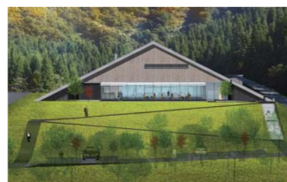
Hakkaisan Beer Brewery (Nagamori Map 1-B)

Address: 459, Nagamori, Minami-Unonuma City Phone: 025-775-7707 Opening Hours: 10:00-17:00 (be subject to change with season) Holiday: January 1st A Yukimuro Snow Cellar tour is conducted frequently and limited to 15 participants per tour. Please sign up to join a tour on the day of your visit.