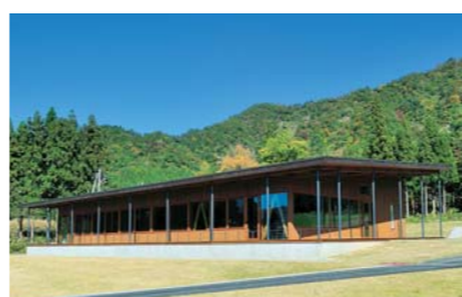
Hakkaisan Company Cafeteria (Nagamori Map 1-C)

Address: 415-23, Nagamori, Minami-Unonuma City Phone: 025-775-3500 Opening Hours: 11:00-15:00 Holiday: January 1st