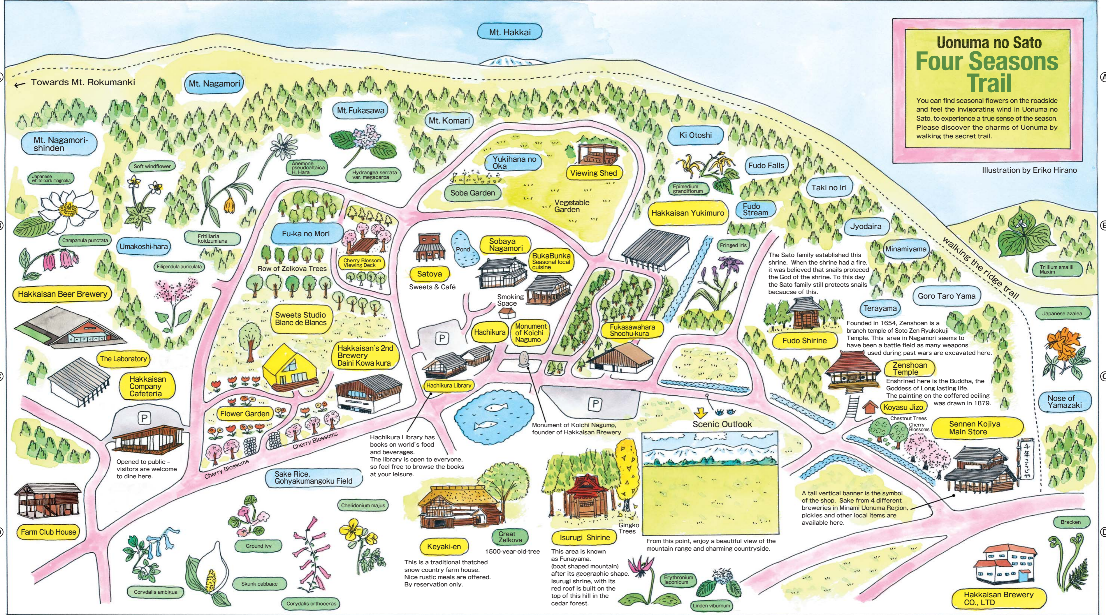
Illustration by Eriko Hirano

You can find seasonal flowers on the roadside and feel the invigorating wind in Unuma no Sato, to experience a true sense of the season. Please discover the charms of Unuma by walking the secret trail.