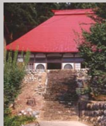
Zenshoan Temple (Nagamori Map 4-C)

The Sato family established this shrine. When the shrine had a fire, it was believed that snails protected the God of the shrine. To this day the Sato family still protects snails because of this.