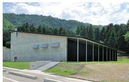
The Laboratory (Nagamori Map 1-C)

A two story building housing a confection making facility with a viewing window on the 1st floor, and kitchen studios with four complete island kitchens for cooking seminars and workshops on the 2nd floor.